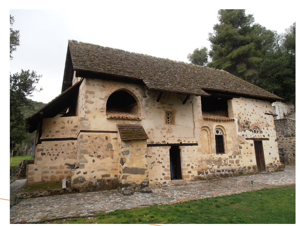
11th century AD