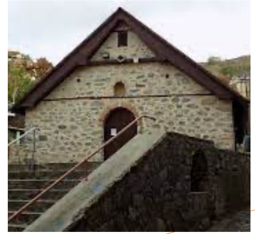
early 16th century