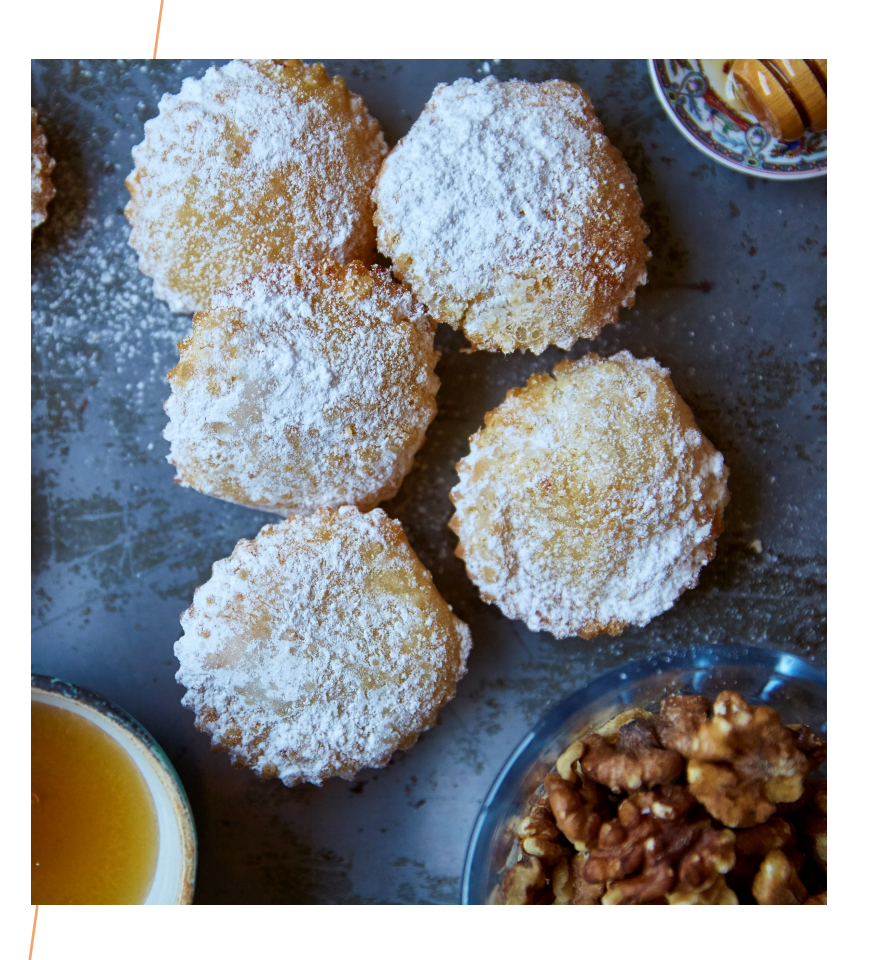
Called: Pourekia Eat them during Christmas