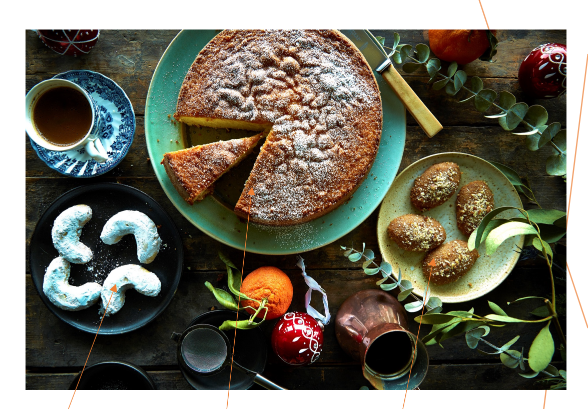
Called Melomakarona Eat them during Christmas

Called Vasilopita Eat them during New Year's Eve