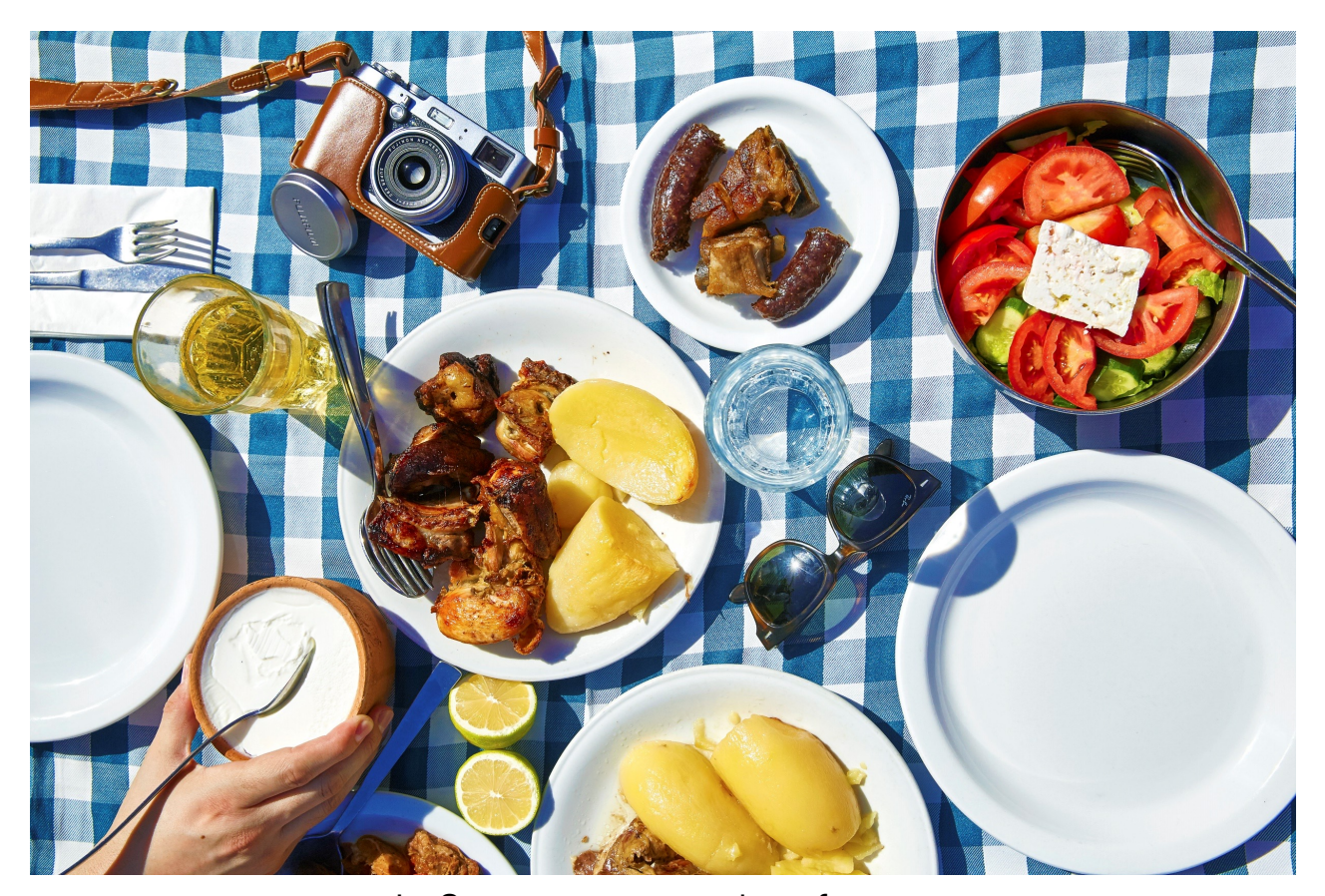
In Cyprus, we eat a lot of meat. This is the common table in every family during every festival.