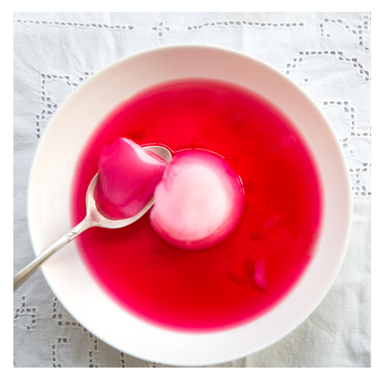
Called: Mahalepi Eat it during summer