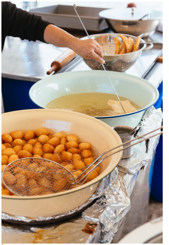
Called: Loukoumades Eat them during the feast Theofania